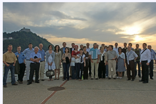
First Annual AquaFit4Use meeting in San Sebastián

In conclusion, this first workshop between these three water-related projects was a fruitful start and a good opportunity for knowledge exchange and "learning from each other" outside the project. AquaFit4Use will continue looking for opportunities for inter-project collaboration.