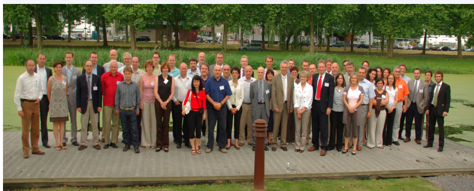
Kick-off meeting AquaFit4Use: Consortium and Scientific Officer