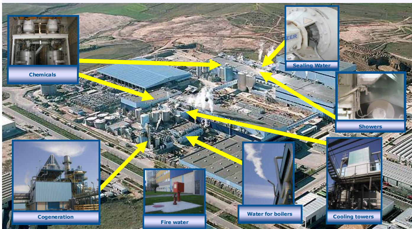
Figure 2. Main uses of fresh water in Holmen Paper Madrid

Finally, the comparison of the results from the pilot plants of the two alternatives have been also compared in AquaFit4Use.