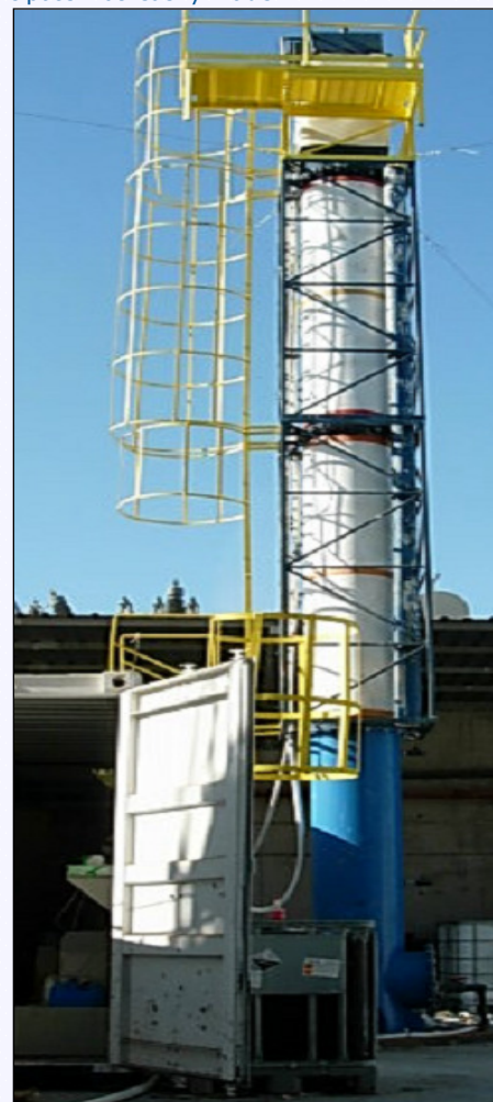
Figure 1. Pilot anaerobic treatment