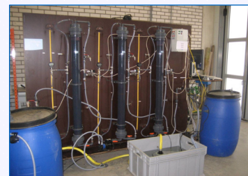
Figure 3. Picture of the Denutritor pilot

Denutritor is a biofilter, which reduces the biofouling potential of water. In Denutritor, microbial populations are grown in biofilms on a filler of polyurethane foams. The microorganisms in these biofilms degrade organic substrates, which are dissolved in the water. So doing, the source of biofouling is removed, and the potential for re-use of the treated water is enhanced. In AquaFit4USE, laboratory and pilot scale Denutritor biofilters are being tested for the treatment of effluents from the chemical and food industries. Effluents from the paper and textile industry will be tested subsequently.