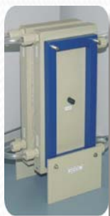
Figure 3.- ED 200 stack

To achieve these characteristics, membrane properties are optimised to this particular application. Renewable energies can be used to drive a plant. Technical, operational and energy costs are low. The membranes feature a high durability and a long life time and such a unit is lightweight and very compact.