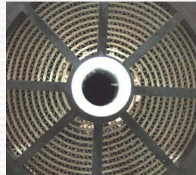
Figure 2.- Cross sectional view of 4inch element with tubular spacer

The tubular spacer technology joins economics of spiral-wound elements and free flow of capillary elements. The tubular feed spacer forms free flow channels within the element without any obstruction because of ligaments across the direction of flow (unlike parallel spacers or diamond spacers). Tubular spacers are made by thermoplastic forming. Width of spacer may be varied according to specifications up to 50 mil. Tubular spacers may be introduced in 4" and 8" spiral wound elements, compatible to conventional equipment in UF, NF and RO treatment. Tubular spacers may be favourably used for filtration of complex heterogeneous wastewaters which tend to form precipitates or agglomerates during concentration of the feed.