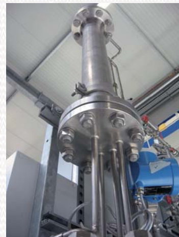
Figure 3.- View of unit for pilot tests